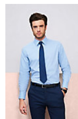
SOL'S BRIGHTON 17000